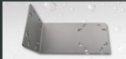
Universal bolt-on corner bracket

Free cooling lubricant of foreign oils quickly and easily